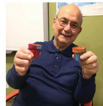
2019 Women's Luncheon & Fashion Show attendees received hand painted pots with chocolates.