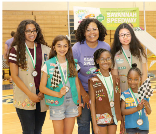
September brings all Girl Scouts of Nassau County and their families together for a campfire at Wantagh Park to celebrate the Girl Scout bond.

early June. Camp Blue Bay in East Hampton brings together all Girl Scout troops for a weekend exploring Scouting in the past and future with an array of activities designed to help the girls finish up the requirements to earn the special Centennial Patch while exploring camp life. Younger girls will learn about nature and camping skills like knot tying and setting up a tent, while hiking and playing games at Valley Stream State Park and earning the Girl Scouts Love State Parks 2019 patch.