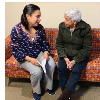
In Corazon de Oro, or Heart of Gold , individuals in the early to moderate stages are stimulated in their native language within a structured and comfortable social environment.