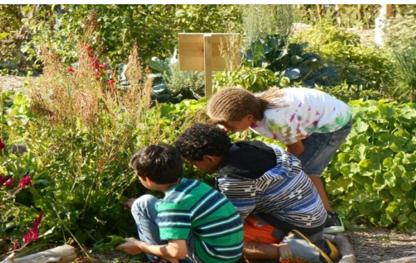
Getting the gardens (and their own selves) ready for the winter months

Summer is just winding down, and at North Shore Child & Family Guidance Center that means it's time to prepare the organic gardens for winter and allowing nature to guide the healing process!