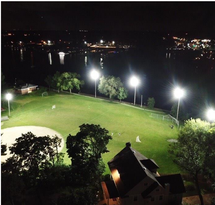
The LED floods, just recently installed, lighting up the entire Dejana Field. Photo taken from a drone high above.

not have programs in the spring and summer but fall programs have started in earnest. This fall’s line-up includes kickball; t-ball, tennis, boys’ baseball, girls’ softball, basketball, soccer, special needs sports, lacrosse and beach badminton.