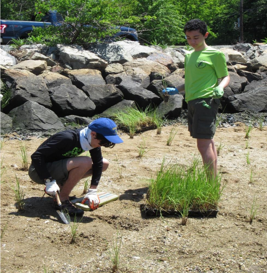
Planting smooth cord grass in the Manhasset Bay estuary mud flats; part of their conservation project.