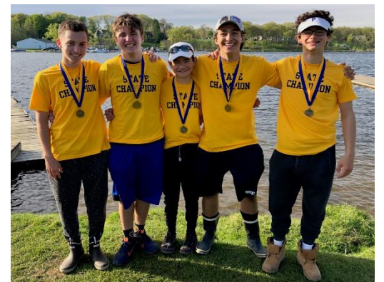
Proud smiles from New York State Champions in Men's Freshmen Four

This past spring Port Rowing earned nine medals including winning title of State Champion for Women's Pair and Men's Freshman Four. This summer for the first time in Port Rowing history, one of the members of the class of 2019 was chosen to join the elite group of rowers to compete at the Junior World Championships in Tokyo, Japan.