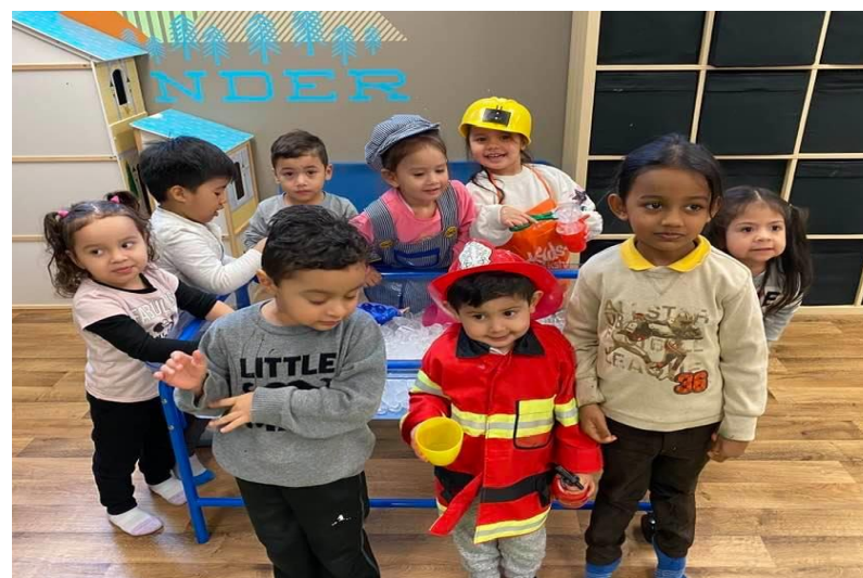
Stepping Stones class participants this Winter having "freezing" fun, while exploring some fascinating properties of ice, including how ice melts.

that brings families together in a supportive environment.