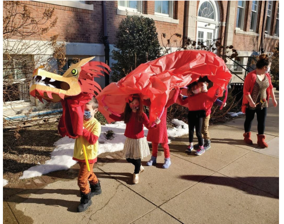
Port Washington Children's Center participate in their first Lunar New Year parade around the Landmark Building on Main Street

Parents are applauding the Children's Center for their childcare and education efforts, despite the challenges this past year. “The Children's Center has done a wonderful job ensuring our young children enjoy a safe, full 5 days with enriching activities throughout the pandemic. The teachers and staff adapted procedures seamlessly to comply with COVID protocols and have communicated with the Center's families on a regular basis. They also implemented excellent technology to allow for contactless check ins and the ability to communicate directly with the teachers, all while providing the