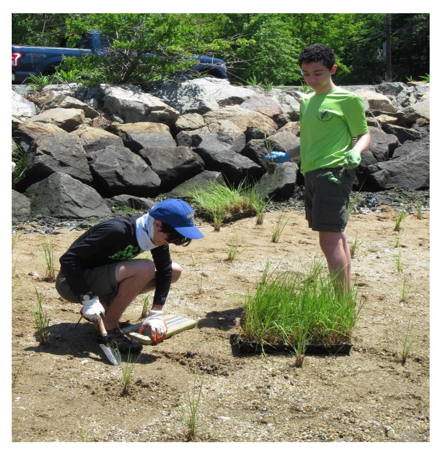
Planting smooth cord grass in the Manhasset Bay estuary mud flats; part of their conservation project.