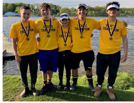
Proud smiles from New York State Champions in Men's Freshmen Four

This past spring Port Rowing earned nine medals including winning title of State Champion for Women's Pair and Men's Freshman Four. This summer for the first time in Port Rowing history, one of the members of the class of 2019 was chosen to join the elite group of rowers to compete at the Junior World Championships in Tokyo, Japan.