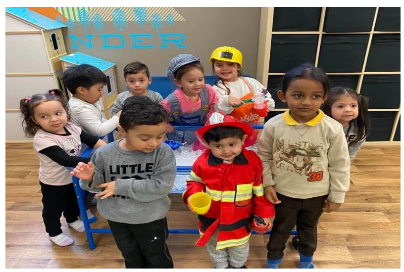
Stepping Stones class participants this Winter having "freezing" fun, while exploring some fascinating properties of ice, including how ice melts.