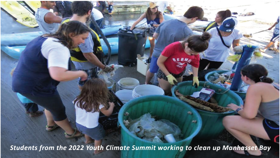
Students from the 2022 Youth Climate Summit working to clean up Manhasset Bay

Fifty-five years ago, a group of concerned Port Washington residents met to discuss their concerns about the state of the Port Washington community. From that, Residents for a More Beautiful Port Washington (now Residents Forward ) was born. In the decades following its founding, Residents Forward focused on environmental safety concerns and beautifying, cleaning and improving the town's public spaces, and, in the process, became one of Port's most beloved and respected nonprofit organizations. They recently changed their mission to reflect the broader work they are doing: inspiring and unifying the residents of Port Washington in order to protect and advance the vibrancy, resiliency, sustainability and beauty of the peninsula. Their six-pronged 2023 Caring for Port Washington Plan includes Environmental Education, Waterfront Protection, Cleanliness, Advocacy, Beautification and Community Building Events. Visible manifestations of this vision are everywhere: Project Clean Green Main Street (monthly Main Street clean-up crews), Let's Walk PW (signs inspiring residents to walk more), the engaging and beautiful Port Washington Mural Project, and the expansion of the Manhasset Bay Walk. Their work with young people includes Environmental Education in the elementary schools and the