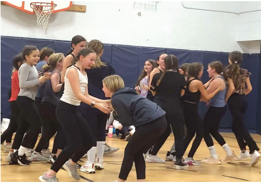
Middle Schoolers having a blast at the video game and dodgeball tournaments

with the expectation that the impact on our residents would get far worse in particular for food and housing, we quickly assembled a leadership team, a legal team, raised funds and deployed those funds partnering with several community and faith-based organizations. In the end we were able to provide $350,000 to help hundreds of families in a very timely manner. This is in addition to the annual grants the Chest has been providing for over 70 years.